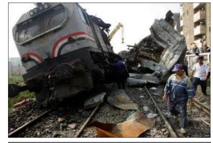
A Crashed Train: Unknown Source 17 November 2012

Cala presented me with an image of a mangled train car (C 10-2,1,49). The picture was taken aiming down the tracks. A train car in the center is clearly tilted to the left and no longer correctly atop the rails. Another large metal object can be seen just ahead of the train car,