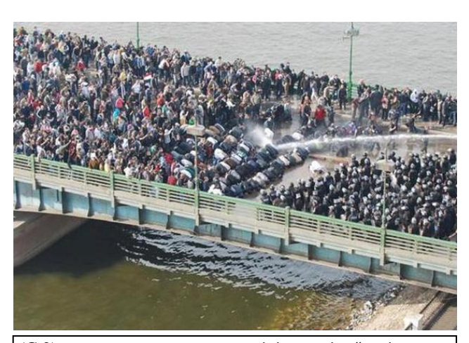
(C 2) Praying protesters sprayed during the "Bridge Battle:" Al Masri Yum 28 January 2011

The "Friday of Rage" was a "million man march" to Tahrir Square that took place on the 28<sup>th</sup> of January 2011 after the Muslim Friday prayers. It involved many marches starting from different locations throughout Cairo, snaking their way towards Tahrir Square (Mackey 2011). Clashes between these marches and police were some of the most violent of the 18 Days of Protest, with police