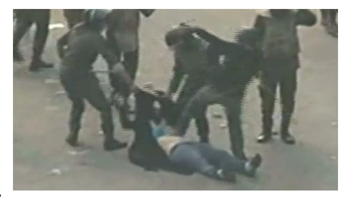
(B 1) An Image of the Blue Bra Woman 17 Dec. 2011

Gamal was especially expressive about his experience of a video of the "Blue Bra Woman" (Gv2-2,2,11). He explained: "You still have the same feeling directly. It's come directly very, very strong